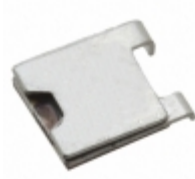
ZEN056V230A16CE Littelfuse Inc. TVS POLYZEN SMD 5.6V