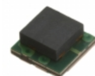
ZEN056V230A16YC Littelfuse Inc. POLYZEN PPTC/ZENER SMD