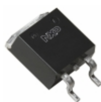
PSMN4R6-60BS,118 Nexperia USA Inc. MOSFET N-CH 60V 100A D2PAK