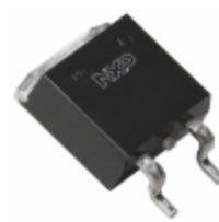
PSMN4R8-100BSEJ Nexperia USA Inc. MOSFET N-CH 100V D2PAK